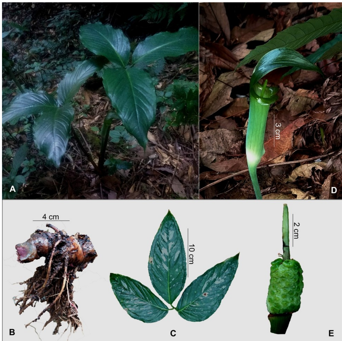
Figure 1. Arisaema petiolulatum Hook.f. A. Flowering plant in habitat; B. Rhizome; C. Leaf (Adaxial surface view); D. Inflorescence (lateral view); E. Female spadix.

For morphological-based section assignment and description, we followed Gusman and Gusman (2006), Li et al. (2010) and Murata et al. (2013) using the morphological terminologies and descriptions (Noltie, 1994; Li et al. 2010). Specimens of Arisaema petiolulatum Hook.f. and Arisaema anatinum Brugg. were collected from the cool broadleaved forests of Samdrup Jongkhar and Trongsa districts during the NWFP survey, annual bird festival, and mammal survey in 2019 and 2020. Photographs of